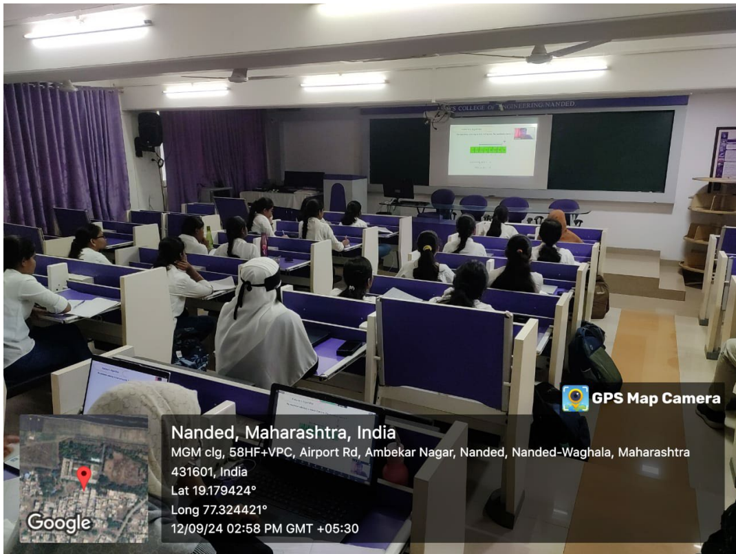
Online Training for Atlassian Internship Drive (12-09-2024)