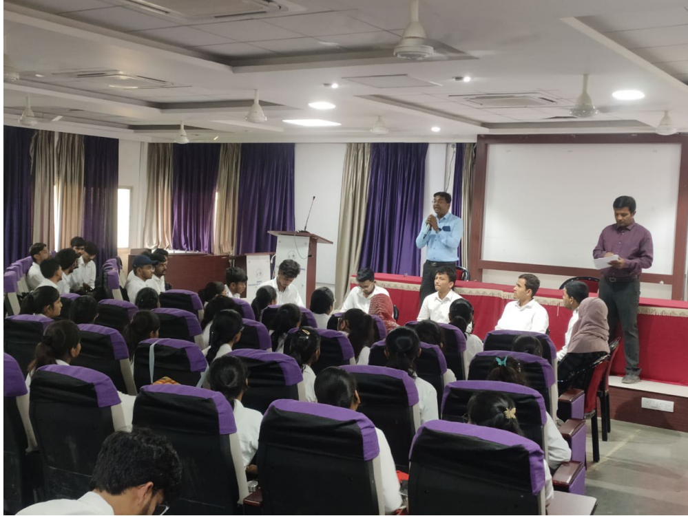
Group Discussion activity during Business English & Soft Skills Training (26-02-2024)