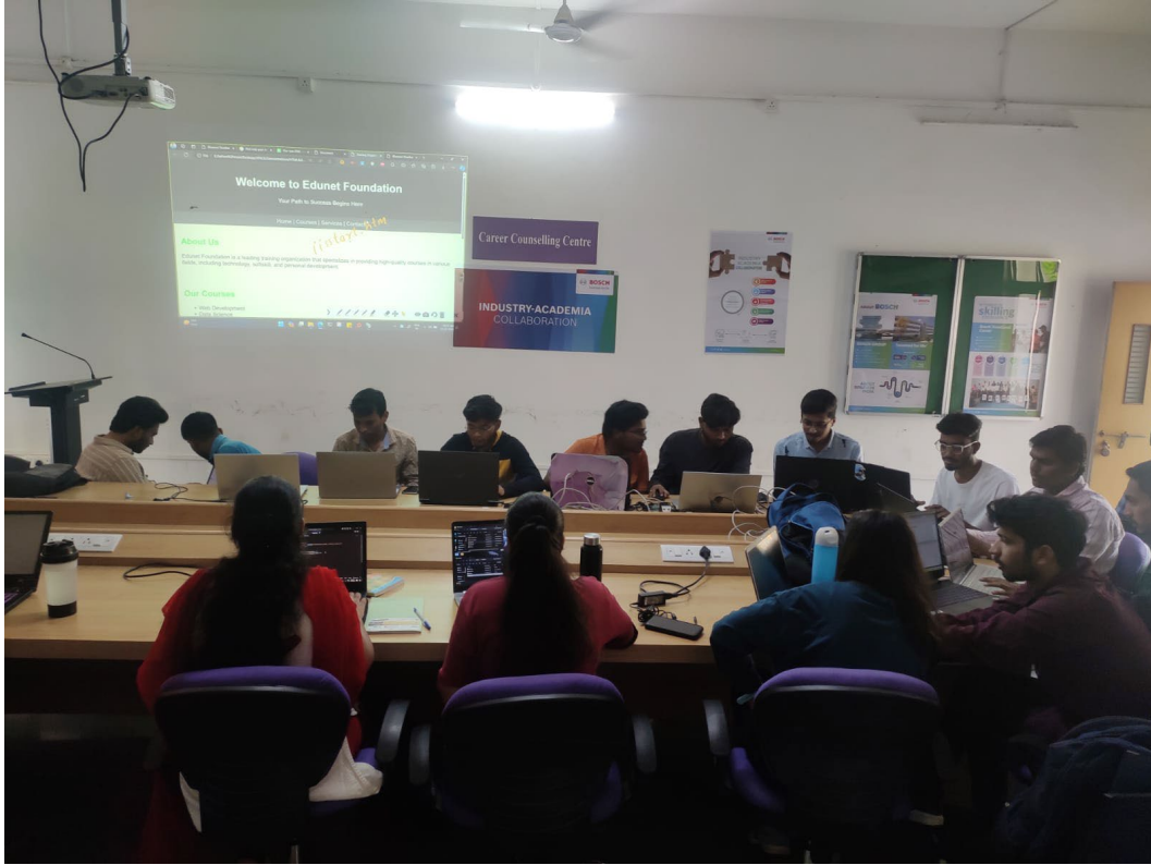
Hands-on Training Session -Edunet Technical Training (30-07-2024)